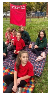
1/2 D House teams at the Cross Country