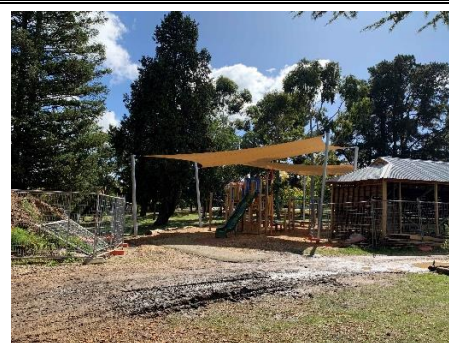
Senior playground complete with shade sails